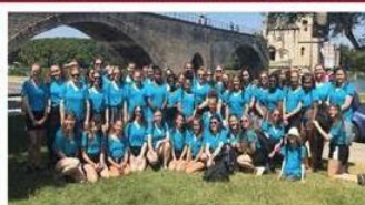
Cantores on tour in Provence