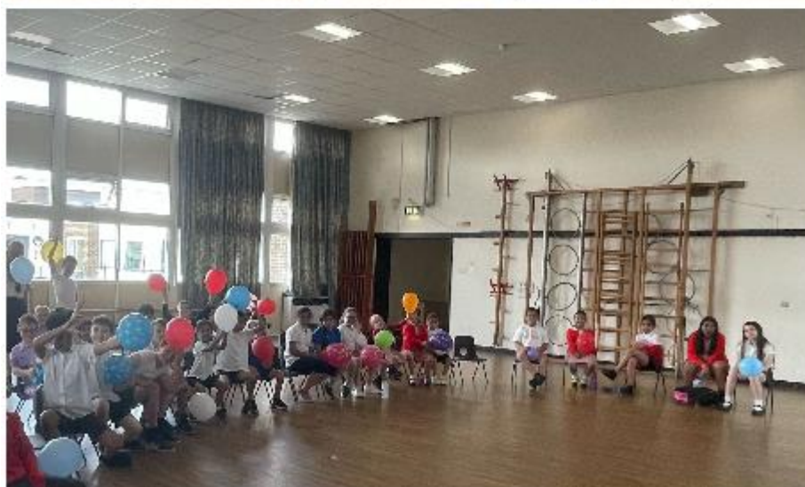
A movie treat at Breakfast Club.