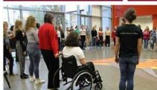
Workshop with the ENO

Discover out more at www.thelutonmusicmix.com/luton-youth-cantores/