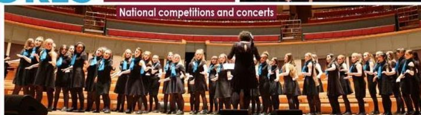
National competitions and concerts

Discover out more at www.thelutonmusicmix.com/luton-youth-cantores/