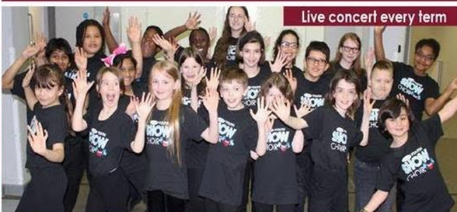
Live concert every term

★ Singing group for pupils aged 7-18 years ★