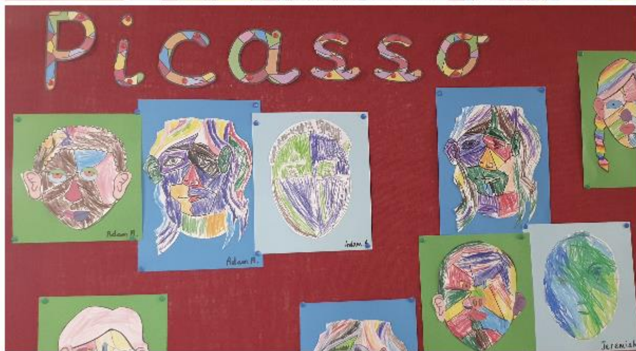
Art in Yr 1