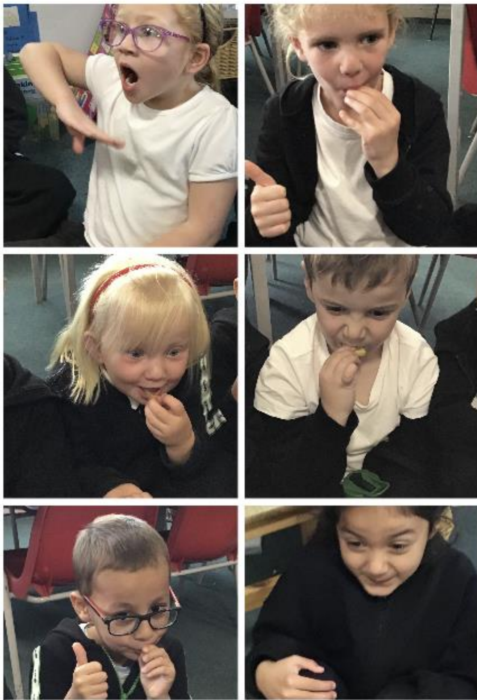
What happens when Yr 1 taste lemons!