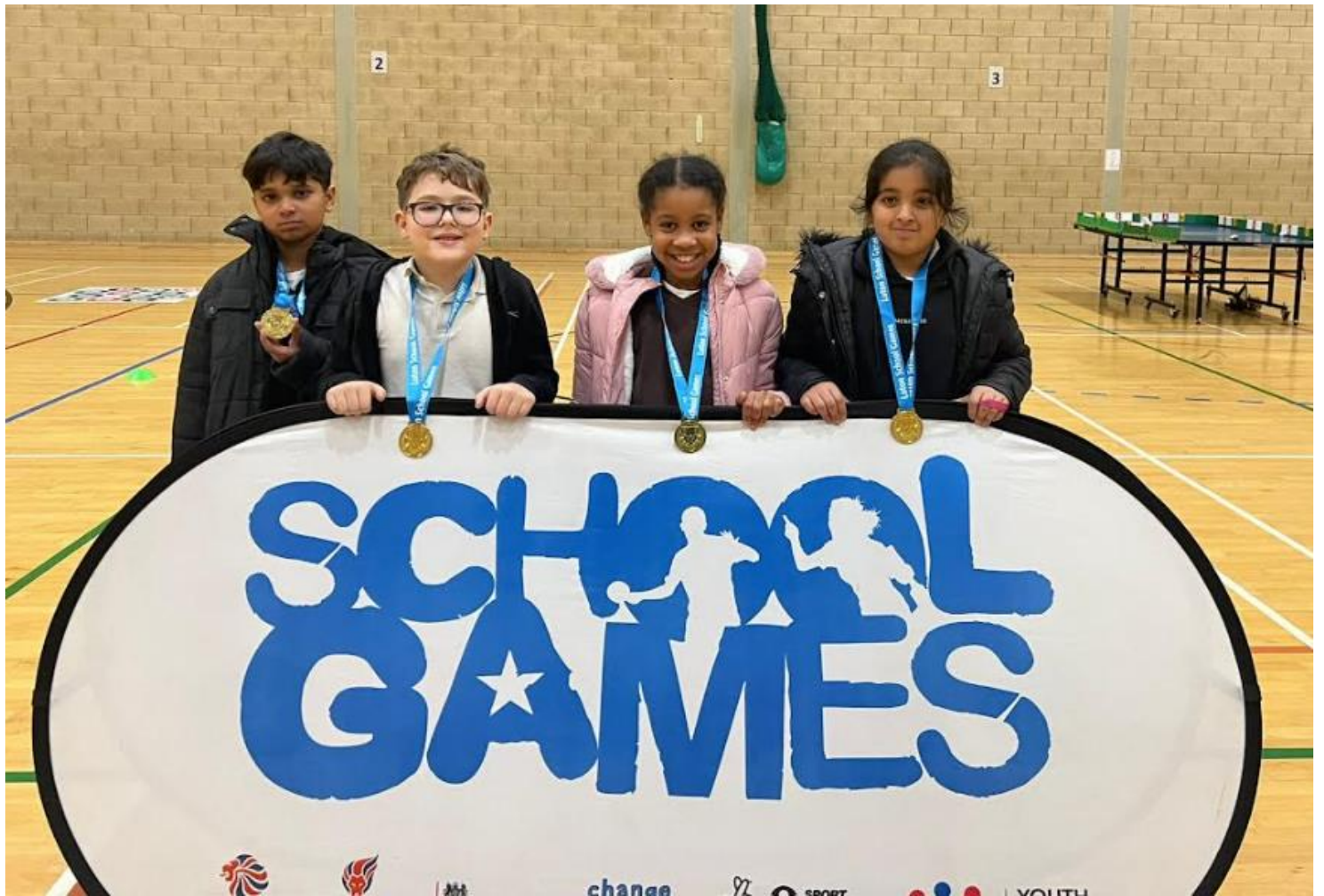
Yr 6 Sportability!