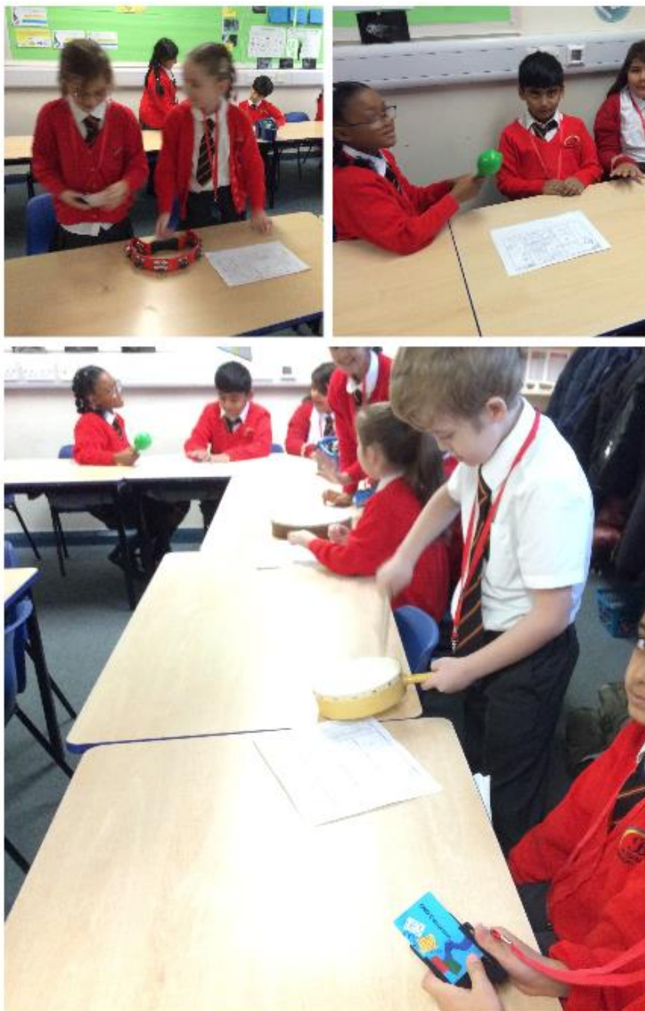
Year 3's English National Opera music composition project.