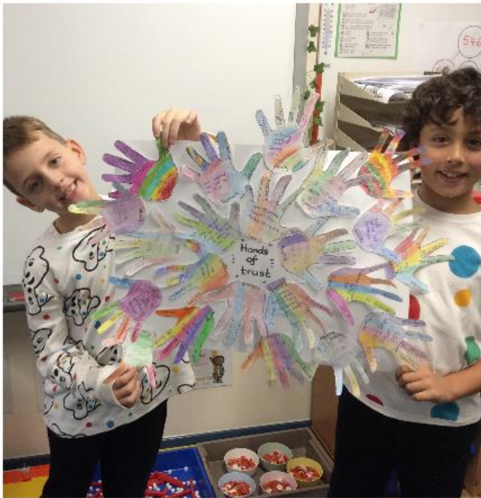
Year 3 Anti Bullying Week PSHE Activities