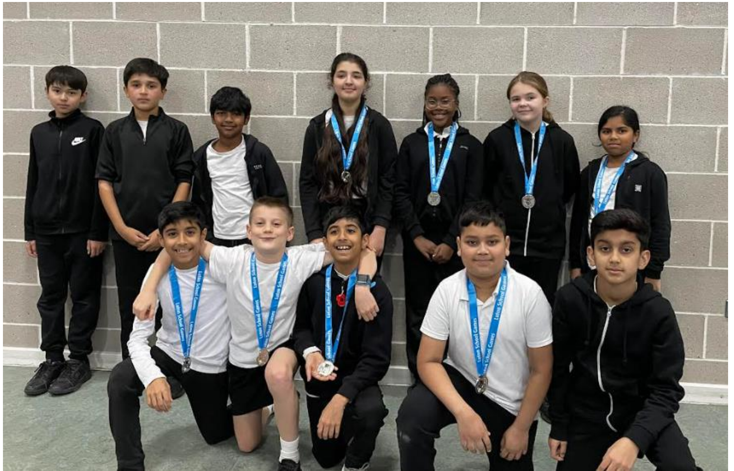
Yr 6 students at a table tennis competition at William Austin - one of the boys' teams came 2nd and the girls team also came 2nd! Both teams are through to the next round in December.