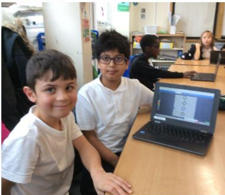
Conductive music workshop this week in Yr 5.